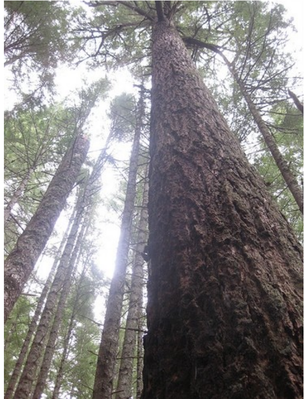
Photos from upper left, clockwise: decommissioned road, large snag, large Doug Fir, variability in decay and new hemlock