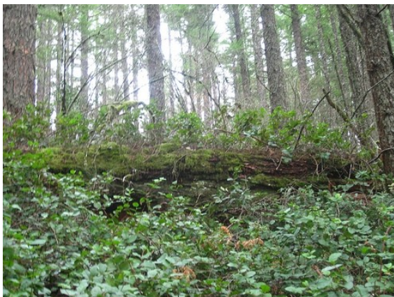
Photos from upper left, across and down: large Doug Firs, steep slope, woodpecker presence, large Doug Fir, Hemlock understory, large snag with Madrone, downed tree with salal growth