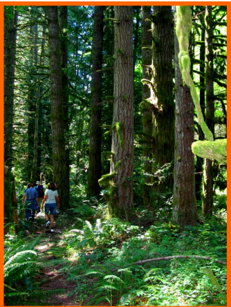
Residents walk on a trail through a mature forest proposed to be logged off Fellows Rd.

The proposed logging project would include cutting along Nate Creek, Little Clear Creek, as well as numerous tributaries for the Milk Creek and Clackamas River. Currently, nearby industrial logging practices on private lands already raise a grave threat to the health of these fish-bearing creeks and rivers. Additional cutting of forest will increase sediment loads, among other impacts to fish habitat.