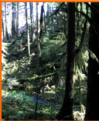
Nate Creek, near Bauer Rd, adjacent to an existing clearcut on private land

For decades, residents near the proposed “Highland Fling” logging project have kept up systems of trails on their neighboring BLM lands. Accessible to hiking, horseriding and mountain biking, these forests are important to the community. As stewards of the land, the BLM should be prioritizing the preservation of these forests for the public to enjoy.