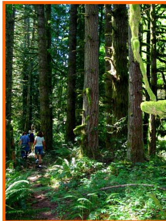
Residents walk on a trail through a mature forest proposed to be logged off Fellows Rd.

The proposed logging project would include cutting along Nate Creek, Little Clear Creek, as well as numerous tributaries for the Milk Creek and Clackamas River. Currently, nearby industrial logging practices on private lands already raise a grave threat to the health of these fish-bearing creeks and rivers. Additional cutting of forest will increase sediment loads, among other impacts to fish habitat.